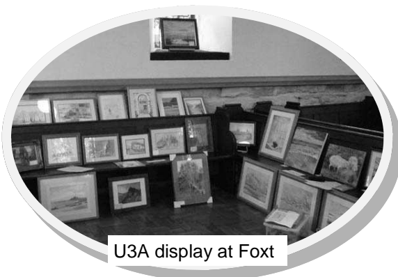
U3A display at Foxt