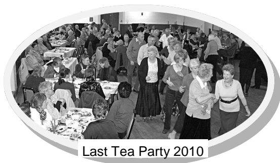
Last Tea Party 2010